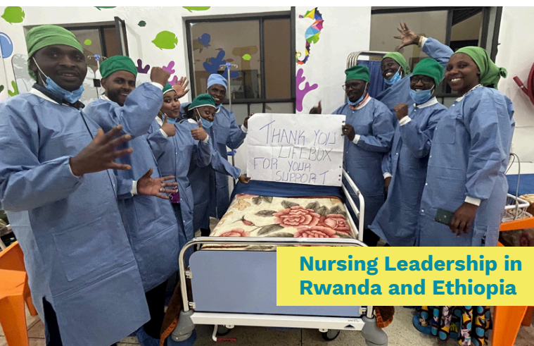
Nursing Leadership in Rwanda and Ethiopia

This year, we delivered our nursing leadership program in Ethiopia and Rwanda, supporting perioperative nurses to grow as leaders and strengthen surgical safety within their hospitals.