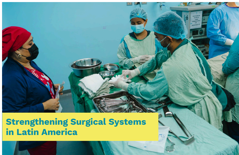
Strengthening Surgical Systems in Latin America

Lifebox has also addressed a critical gap in anesthesia safety by providing life-saving monitoring equipment alongside hands-on training in Honduras, El Salvador, and Guatemala. While needs remain — particularly in expanding access to capnography and specialist training — this work is building stronger anesthesia systems and laying the groundwork to protect thousands more patients across the region in the years ahead.